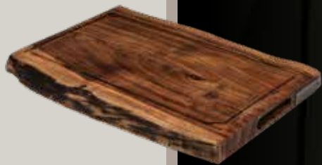
Cutting board acacia wood natural Medium Size: 45 x 30 cm