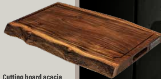
Cutting board acacia wood natural Large Size: 55 x 35 cm