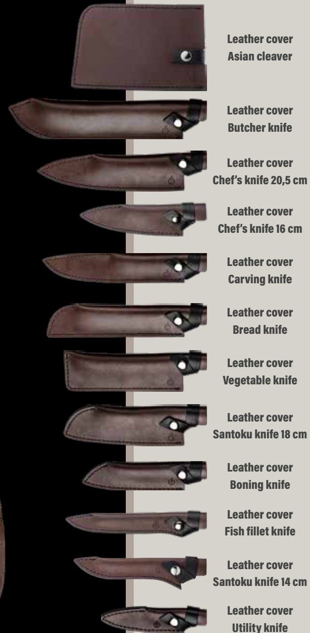
Leather cover Asian cleaver

Space for 8 knives, 3 smaller knives or other kitchen utensils and a separate zipped compartment.