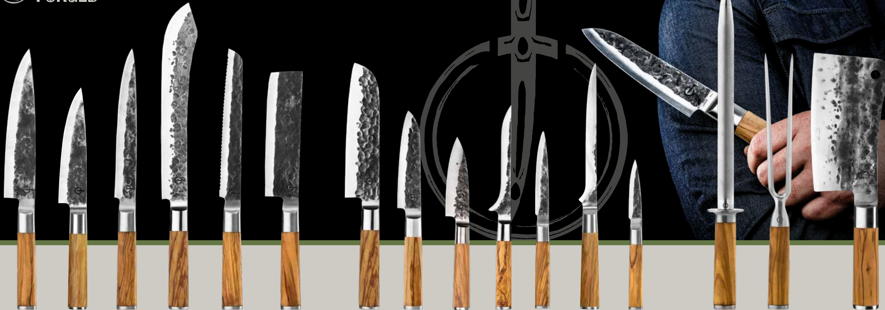
Chef's knife 20,5 cm